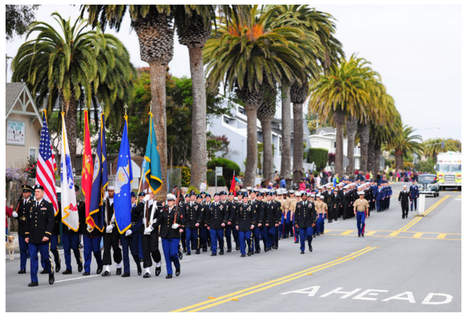
PRESIDIO OF MONTEREY